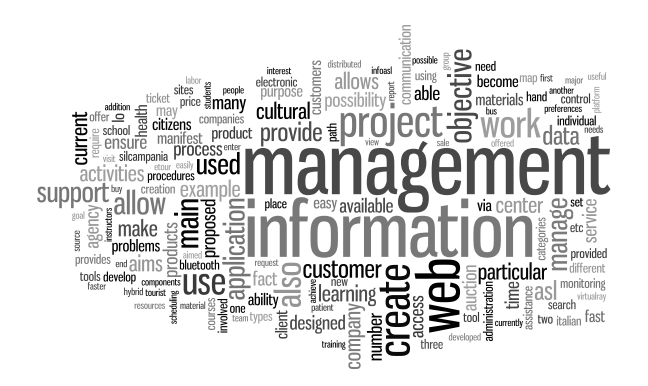
Figure 1. Word cloud extracted from the project abstracts.